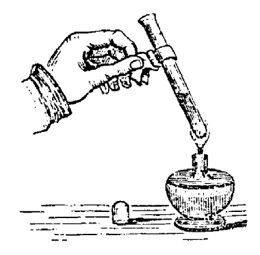
A paper twist test tube clamp, circa 1850 (1)

The ubiquitous spring wire test tube holder is such a simple, logical, convenient device that we tend to assume that it has been in use forever. Surprisingly, it was invented about 1886 by an American chemist, John T. Stoddard. Although chemical supply catalogs from 1893 to the present day have listed this item as the "Stoddard test tube clamp", Stoddard himself remains relatively unknown.